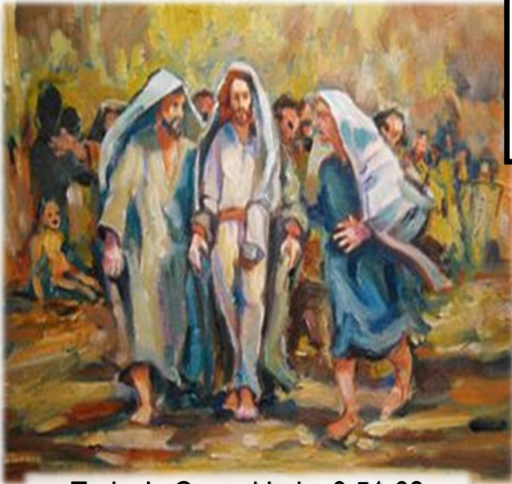
Today's Gospel Luke 9:51-62

Calgary Diocesan: www.rcdiocese-calgary.ab.ca