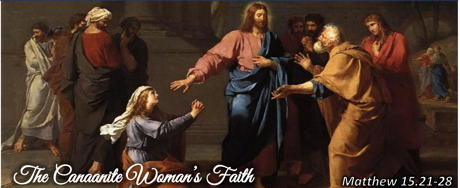
The Canaanite Woman's Faith

Calgary Diocesan: www.rcdiocese-calgary.ab.ca